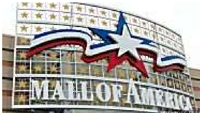
Nation's largest mall, Mall of America, will... ( http://cbs6albany.com/news/nation-world/nations-largest-mall-mall-of-america-will-be-closed-on-thanksgiving )