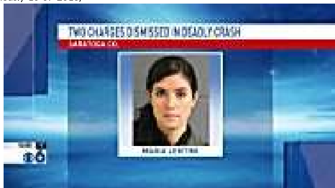
Two charges dropped against woman... ( http://cbs6albany.com/news/local/two-charges-dropped-against-woman-accused-in-deadly-crash )