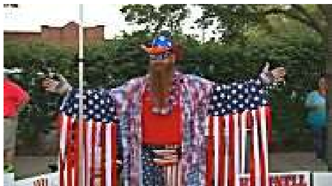
Ohio teacher running for president. Yes... ( http://cbs6albany.com/news/offbeat/ohio-teacher-running-for-president-yes-seriously-10-07-2016 )